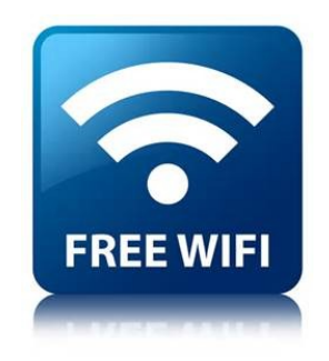
Access Point Name(s): "CPOECU-Guest-Free-WiFi-5" Password Key: "cpoecu1928